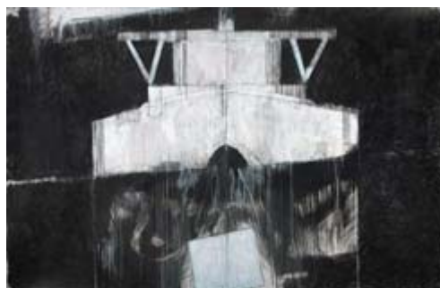
Entropic Transfiguration , Douglas Smith, graphite, pencil and acrylic on two sheets of paper, 2006, 50.5" x 76.5"

every bit of the surface is densely worked without ever becoming too busy. In fact, despite the incredible abundance of lines, strokes and patterns, the works have a quality of restraint and spaciousness.