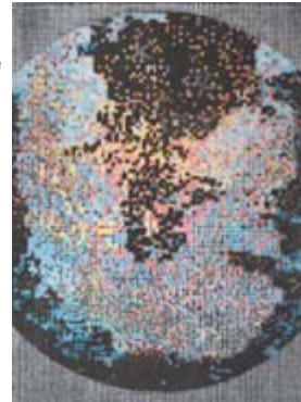
Rapture , Douglas Smith, graphite and acrylic on paper, 2007, 50" x 37"